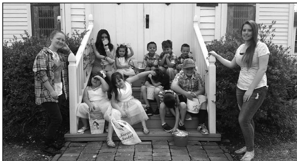
Let the little children come to me. For the kingdom of heaven belongs to such as these.

"Grace... A Place Where Every Service Is A Family Reunion"