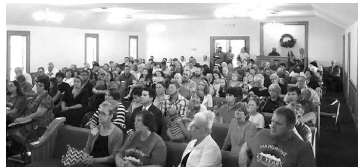
SHOWN ABOVE are attendees at the 65th Anniversary Service held on Aug. 17, 2014.

On Aug. 14, 1949, Hargrove Mission Baptist Church